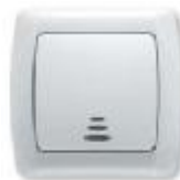
Illuminated Light 9056X014