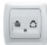
Single Numeric Socket (RJ11) 9056X013