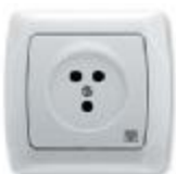
Telephone Socket 9056X011