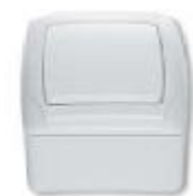
Surface Mount White