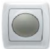
Touch Sensor Dimmer 9056X076