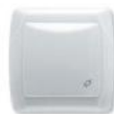
Child-Protected Earthed Socket With Lid 9056X012