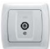
SAT Socket F Connector 9056X096 (End) 9056X097 (Throughpass 10dB)