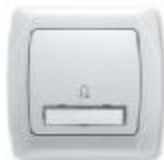
Illuminated Labeled Doorbell 9056X027