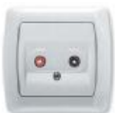
Audio Socket 9056X037