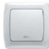
Door Check 9056X005