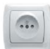
Child Protected UPS Earthed Socket 9056X045

MEANING OF X CODE: 1 = White (Screw Connection), 2 = Cream (Screw Connection), 6 = White (Quick Connection), 7 = Cream (Quick Connection)