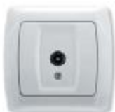
TV Socket 9056X010 (End) 9056X060 (Throughpass) 9056X049 (Lossless)