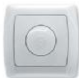
400W RC Dimmer 9056X090