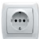
Earthed Socket 9056X008