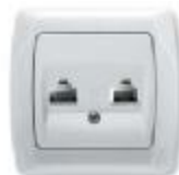
Data - Numeric Socket (RJ45-RJ11) 9056X035 (Cat5E) 9056X335 (Cat6)