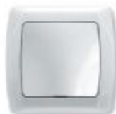
Cable Outlet Cover 9056X077