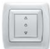
Single-Button Blind Switch 9056X072