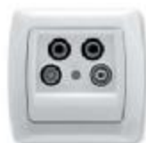
SAT-SAT-TV-RD Socket 9056X053