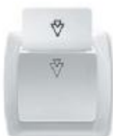
Energy Saver With Card (Without Relay) 9056X065 90561163 (Card) 9056X0** RF

MEANING OF X CODE: 1 = White (Screw Connection), 2 = Cream (Screw Connection), 6 = White (Quick Connection), 7 = Cream (Quick Connection) ** This type product has different frequency values.