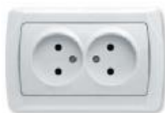
Two-Gang Socket 9056X055