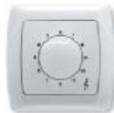
Audio Switch 9056X054 9056X080 (With Transformer) 9056X091 (With Transformer Output)