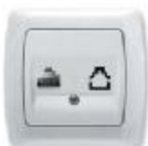
Single Data Socket (RJ45) 9056X032 (Cat5E) 9056X332 (Cat6)