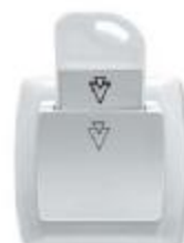
Energy Saver Standard (Without Relay) 9056X051 90561152 (Key Holder With Logo)