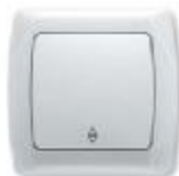
Two Way Switch 9056X004