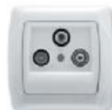
SAT-TV-RD Socket 9056X041 (End) 9056X052 (Throughpass)