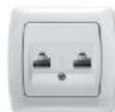
Two-Gang Data Socket (2 x RJ45) 9056X034 (Cat5E) 9056X334 (Cat6)