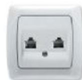
Two-Gang Numeric Socket (2 x RJ11) 9056X033