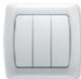
Triple Switch 9056X068