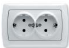
Two-Gang Earthed Socket 9056X056