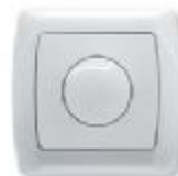
1000W RL Dimmer 9056X069