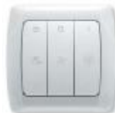
Cooler Switch 9056X098