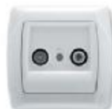
TV-SAT Socket 9056X085 (End) 9056X086-87 (Throughpass)