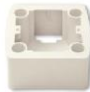
Surface Mount Box Cream 90572009

Surface mount boxes are the best options for usage on plaster. All products belonging to Carmen Opaque family may be used with surface mount boxes.