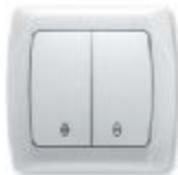
Double Two Way Switch 9056X017