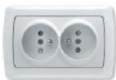
Child-Protected Two-Gang UPS Socket 9056X057