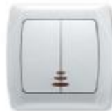
Illuminated Commutator 9056X050