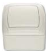
Surface Mount Cream