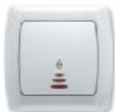
Illuminated Two Way Switch 9056X063