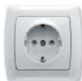
Child Protected Earthed Socket 9056X042