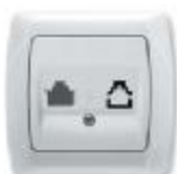
Data Socket Without Jack 9056X132