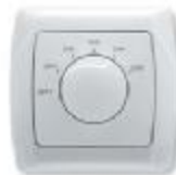
Channel Selection Switch 9056X082