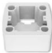
Surface Mount Box White 90571009