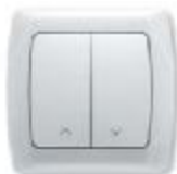
Blind Control Switch 9056X016