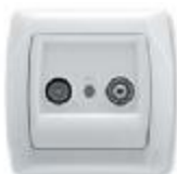
TV-RD Socket 9056X021 (End) 9056X022-25 (Throughpass)