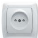
Child Protected Socket 9056X043