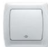
Permutator (Reversing Switch) 9056X031