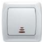
Illuminated Switch 90960X19